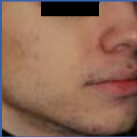
SIX MONTHS AFTER FINAL TREATMENT SESSION