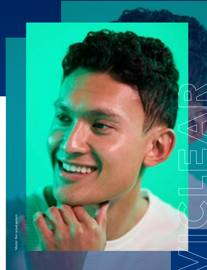
Model. Not actual patient.