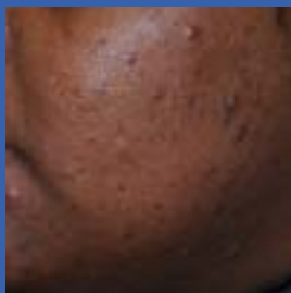
SIX MONTHS AFTER FINAL TREATMENT SESSION