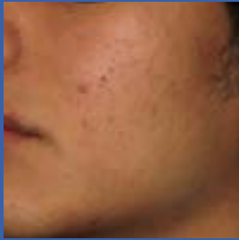
SIX MONTHS AFTER FINAL TREATMENT SESSION